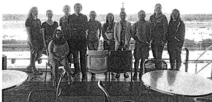
NHS at MIS for Voices for Change on May 8, 2018.