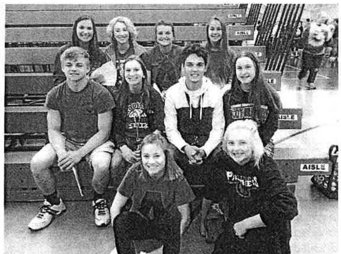
Special Olympics at Siena Heights University on May 11, 2018.