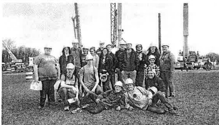
Construction Career Day at Operating Engineers 324