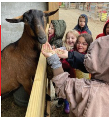
Elementary Field Trips

With Gratitude, Angela Huston Elementary Principal angela.l.huston@addisonschools.us