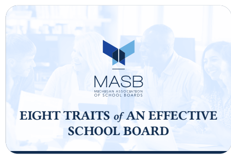
Eight Traits of Effective School Boards: masb.org/8traits