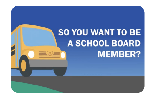
Watch this quick video with tips on How to File and #GetOnBoardMI